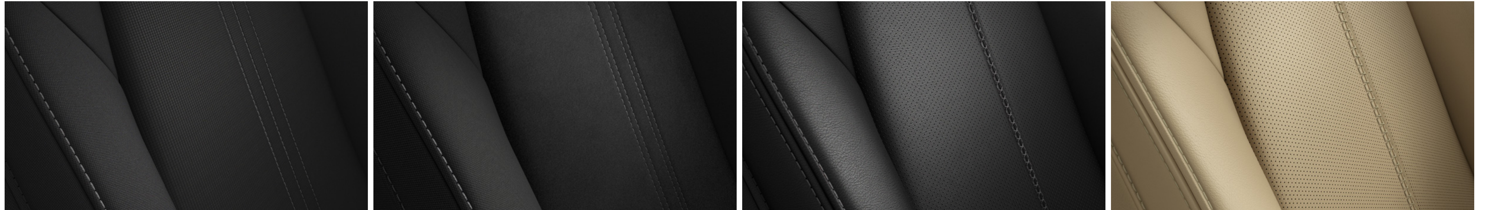
Black cloth (Roadster)