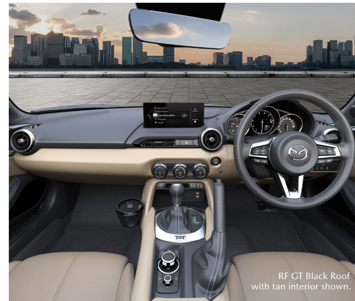
RF GT Black Roof with tan interior shown.