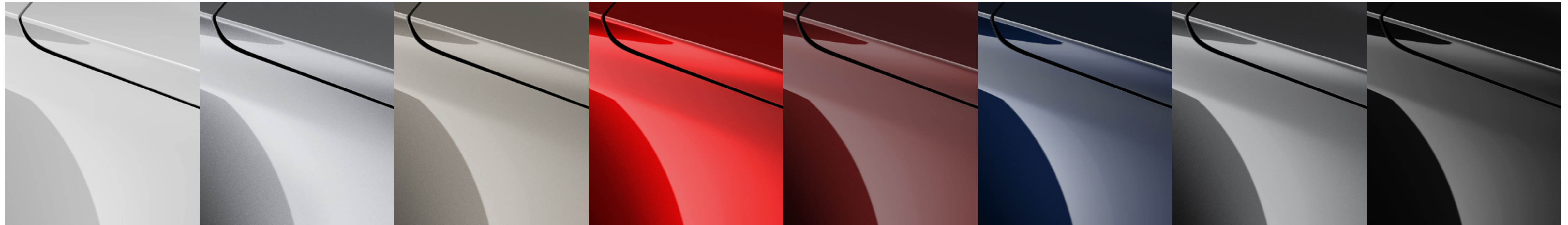
Rhodium White Metallic~