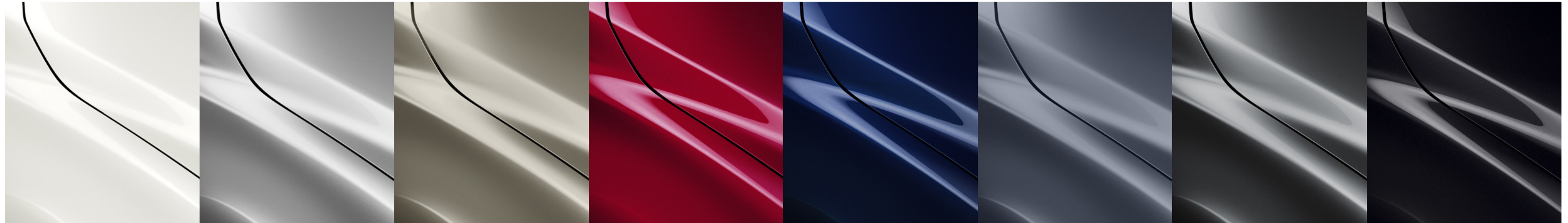
Snowflake White Pearl Mica