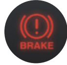
Brake System Warning

It's important that you understand the warning and indicator lights in your CX-8. They include important safety features and engine conditions, and can alert you to potential issues that may require extra attention from you or an expert Mazda Service Technician.