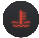
High Engine Coolant Temperature