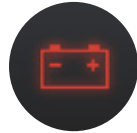
Charging System Warning