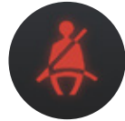
Seat Belt Warning