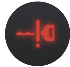
Key Warning Light