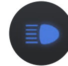
Headlight High-Beam Indicator