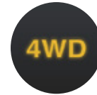
4WD Warning Light