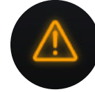
Master Warning Light