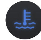
Low Engine Coolant Temperature