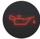
Engine Oil Warning