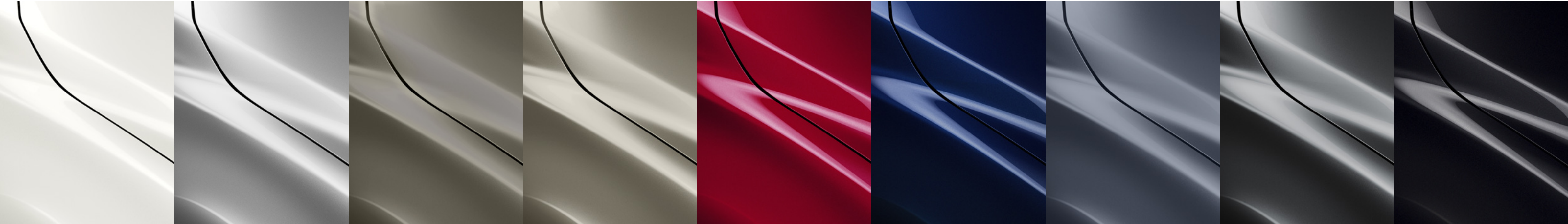
Snowflake White Pearl Mica