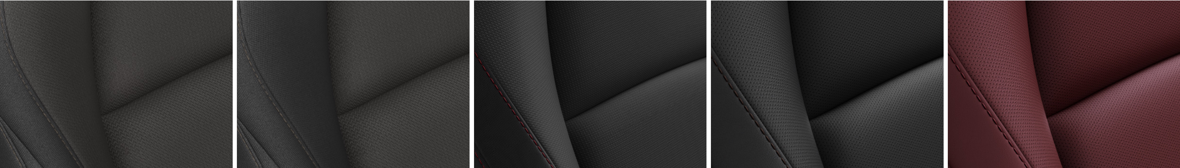
Black cloth (G20 Pure)