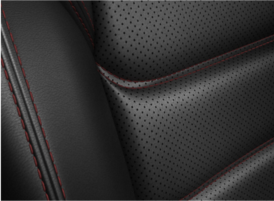
Black leather# with contrast red stitching (GT SP)