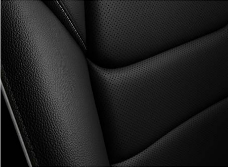
Black Maztex (Touring)