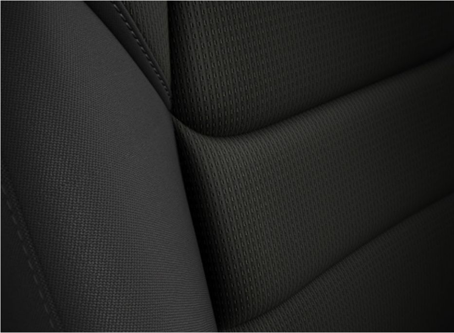
Black cloth (Maxx Sport)