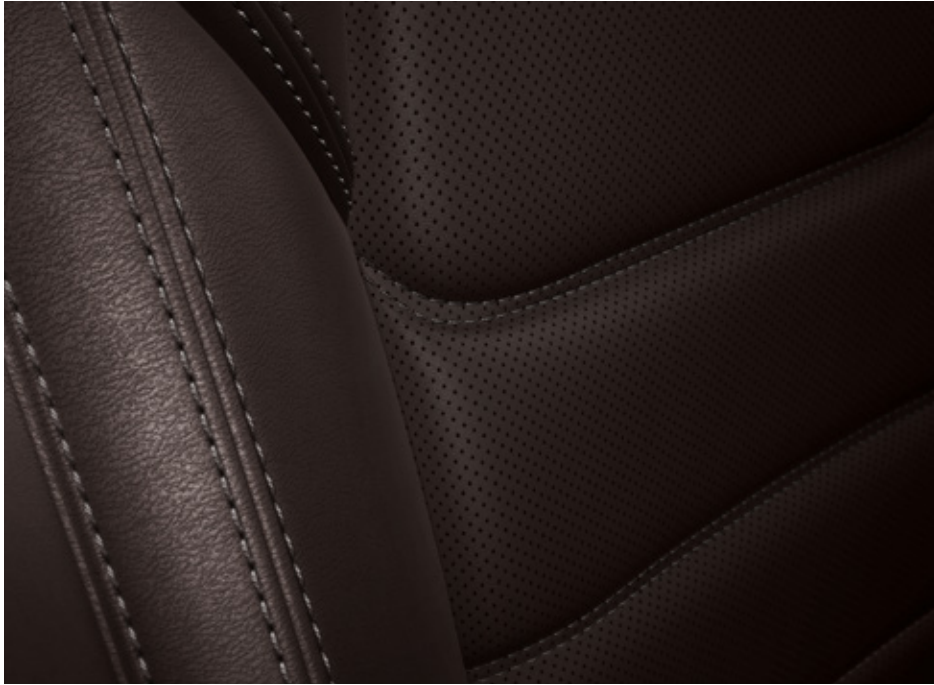
Dark Russet nappa leather# with light grey stitching (Aker)